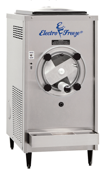
MODEL 877B MODEL 877BRH